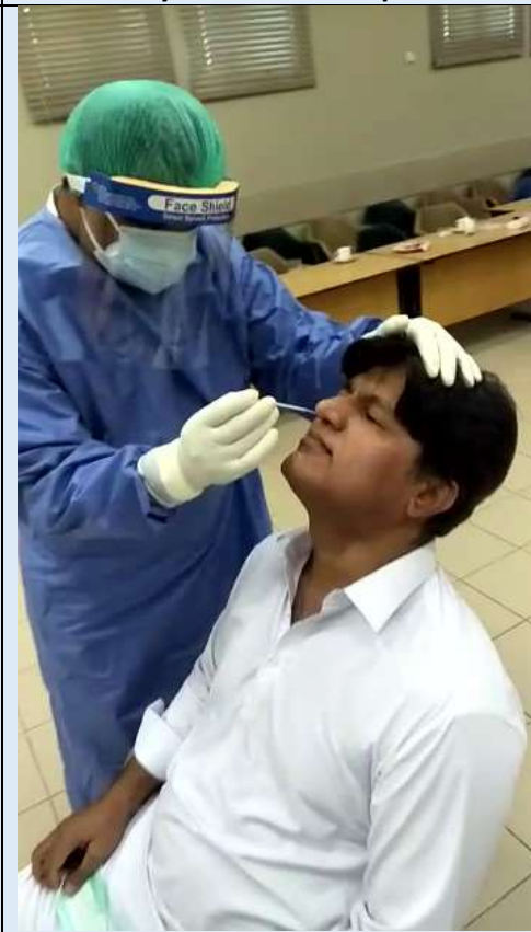
SRSO has started COVID-19 testing of all staff members at head office with the support of District Health Department Sukkur at Head Office.