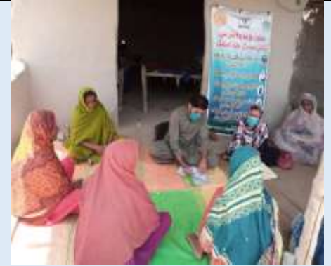
Community Sessions at Mirpurkhas