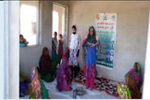
COVID-19 Awareness sessions with communities in District Shikarpur