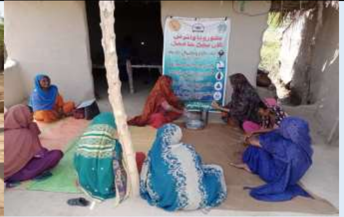
Community Sessions and Hand Washing Activity at District Mirpurkhas