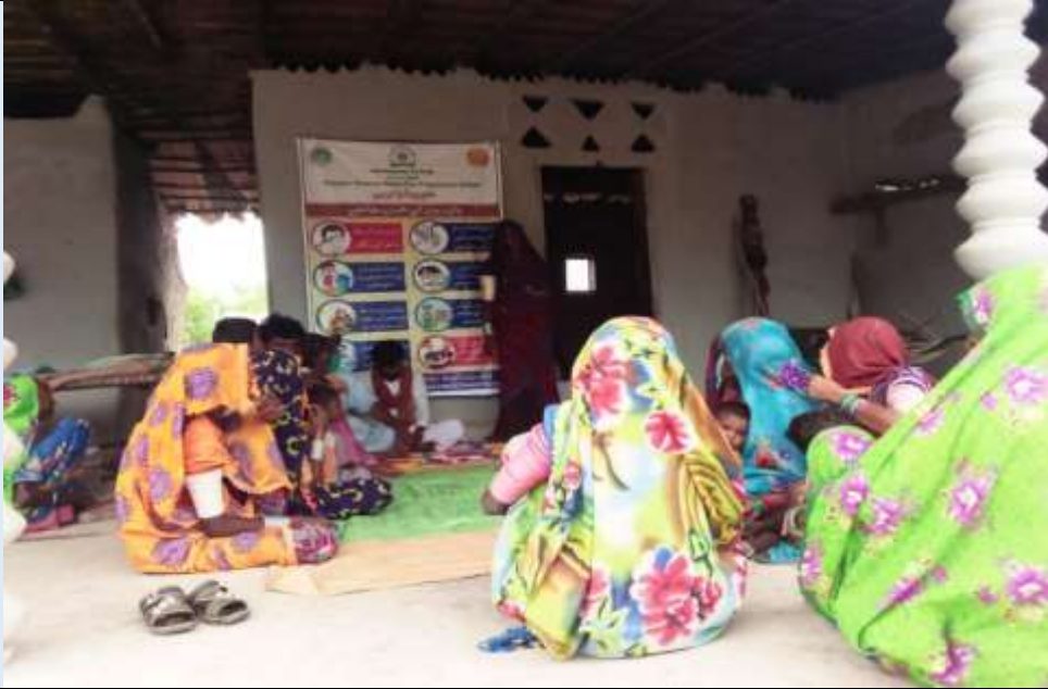
COVID-19 Session with Communities at District Badin