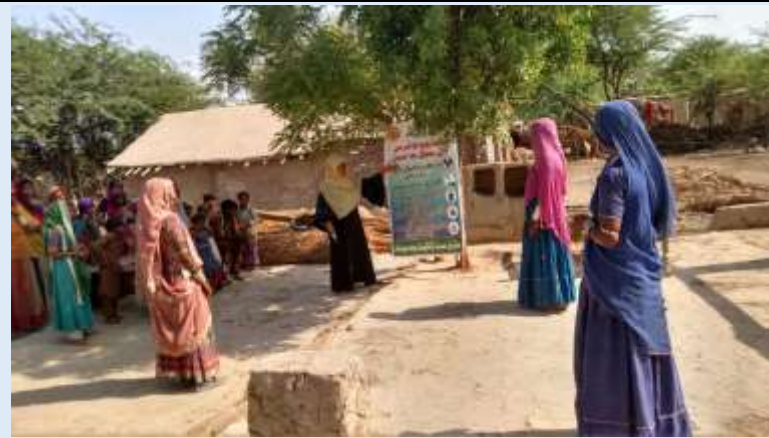
Hand-washing activity at Mirpurkhas